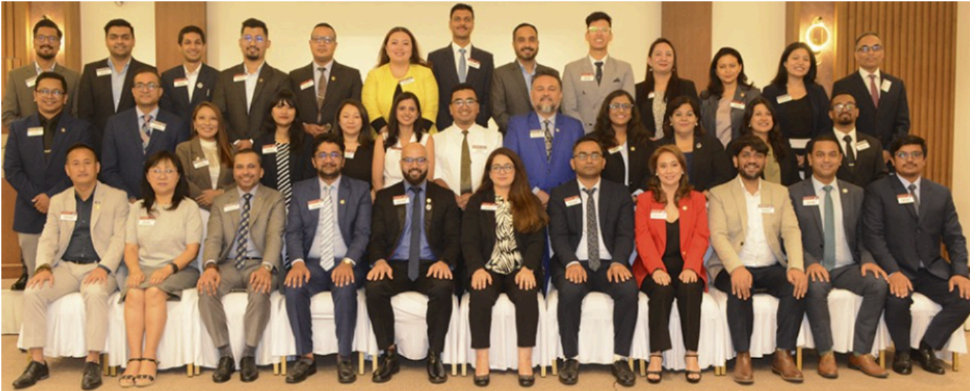
[22-23 June'24] Kathmandu, Nepal