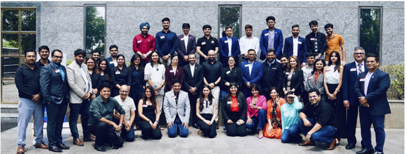
[29-30 June'24] Delhi, India